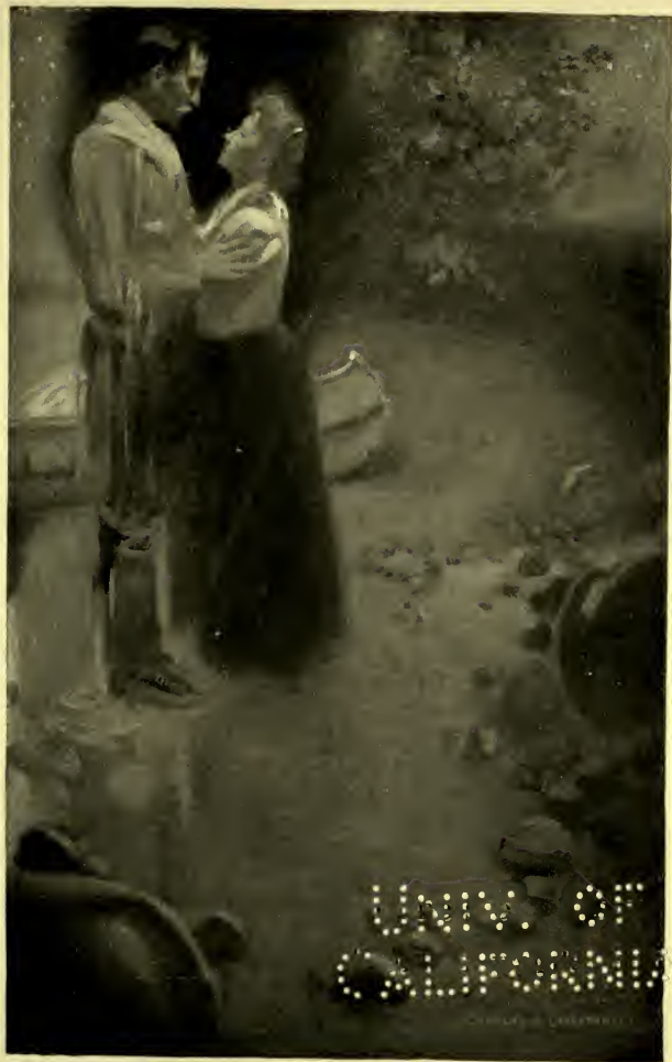
She smiled up at him with trembling lips that whispered to her soul that she must be brave.